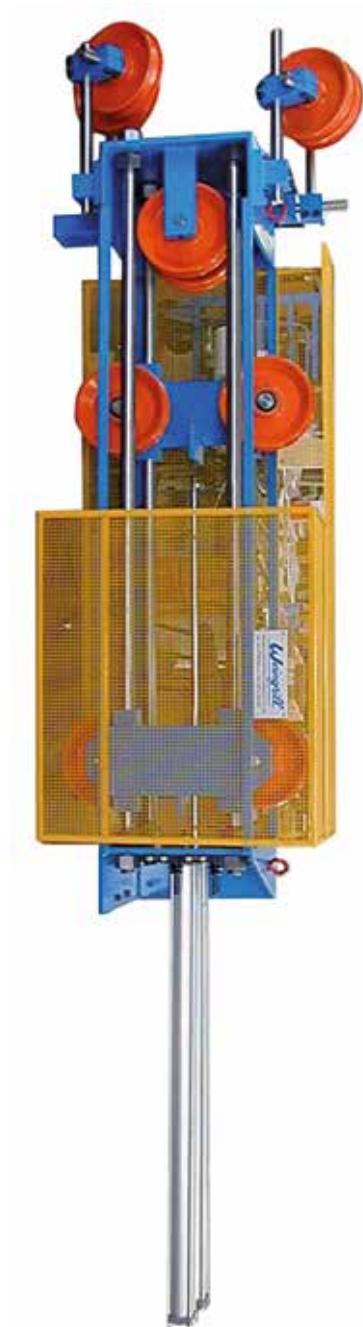
■ ROPE STRETCHER W-RS